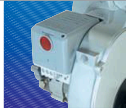
Burner control box

A cable with 6 pole socket is included in the burner equipment.